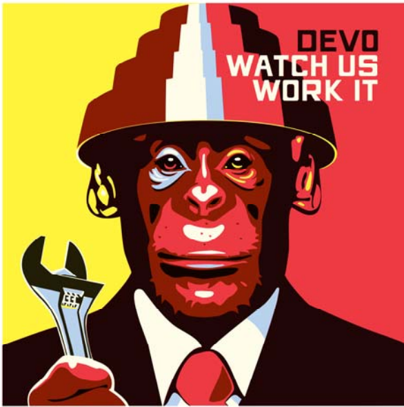
[Apes in the plan: Devo, Watch us Work it , 2007]

Unfortunately, making it big in the States was important to European record labels. That meant playing into the specific systems of racial segregation that control so many aspects of life in the US, including the marketing of music. As a result, European labels pushed their (predominantly White male) techno-pop producers to conform to a more conventional and sellable pop-rock model of sound and performance. As Andy McCluskey of Orchestral Manoeuvres in the Dark recollected in a 2011 interview for The Quietus : ‘We used to have arguments with Virgin all the time. They used to say “Will you make your minds up whether you want to be Can or Abba?”’ ( thequietus.com/articles/07491-orchestral-manoevres-in-the-dark-architecture-and-morality ). One could say the fate of techno-pop was sealed by the European music industry’s reliance upon sales in a racist U.S. marketplace.